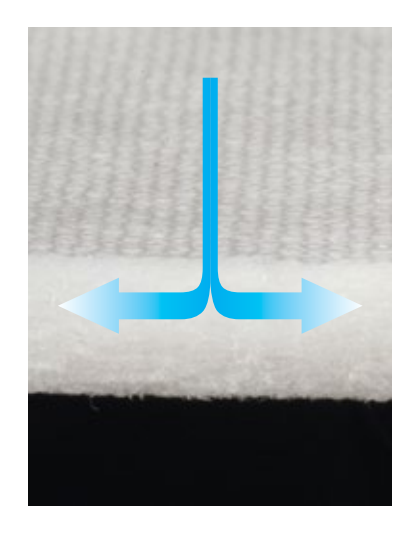
The fibres in the absorbent layer are arranged horizontally so that they encourage fluid to spread evenly across the full breadth of the pad.

Flexible, breathable stretch fabric conforms to the body.